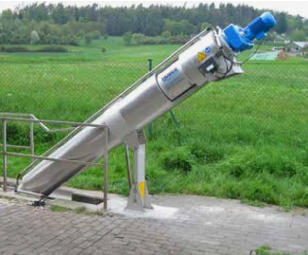
Outdoor installation of a HUBER Micro Strainer ROTAMAT® Ro9.