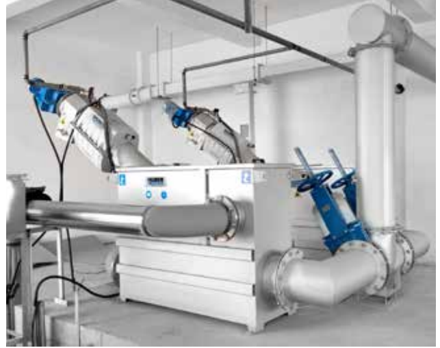
Tank installation of a HUBER Micro Strainer ROTAMAT® Ro9.