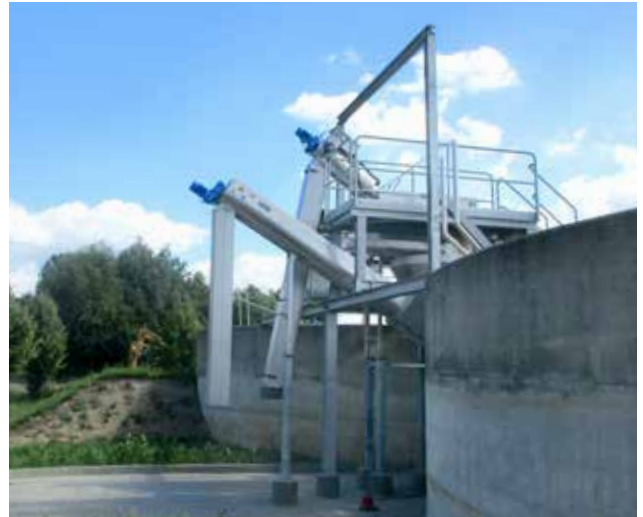
Compact plant designed with a ROTAMAT® Ro9 pre-screening.