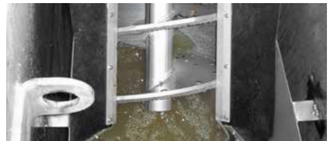
HUBER Micro Strainer ROTAMAT® Ro9 XL with lower maintenance-free ceramic bearing.