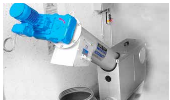
Tank-mounted HUBER Micro Strainer ROTAMAT® EC.