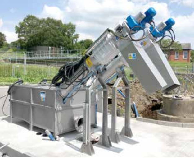
Two HUBER Micro Strainers ROTAMAT® Ro9 in one container. Designed for machine redundancy.