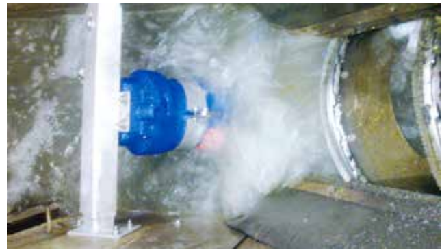
External screenings washing system (ERGA). A preceding washing system washes out the organic matter.