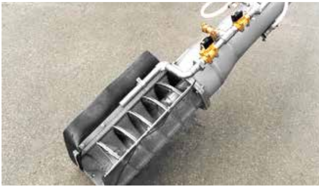
Integrated screenings washing system (IRGA). The ROTAMAT® principle allows for integration of the screenings washing system directly in the lower end of the rising pipe.