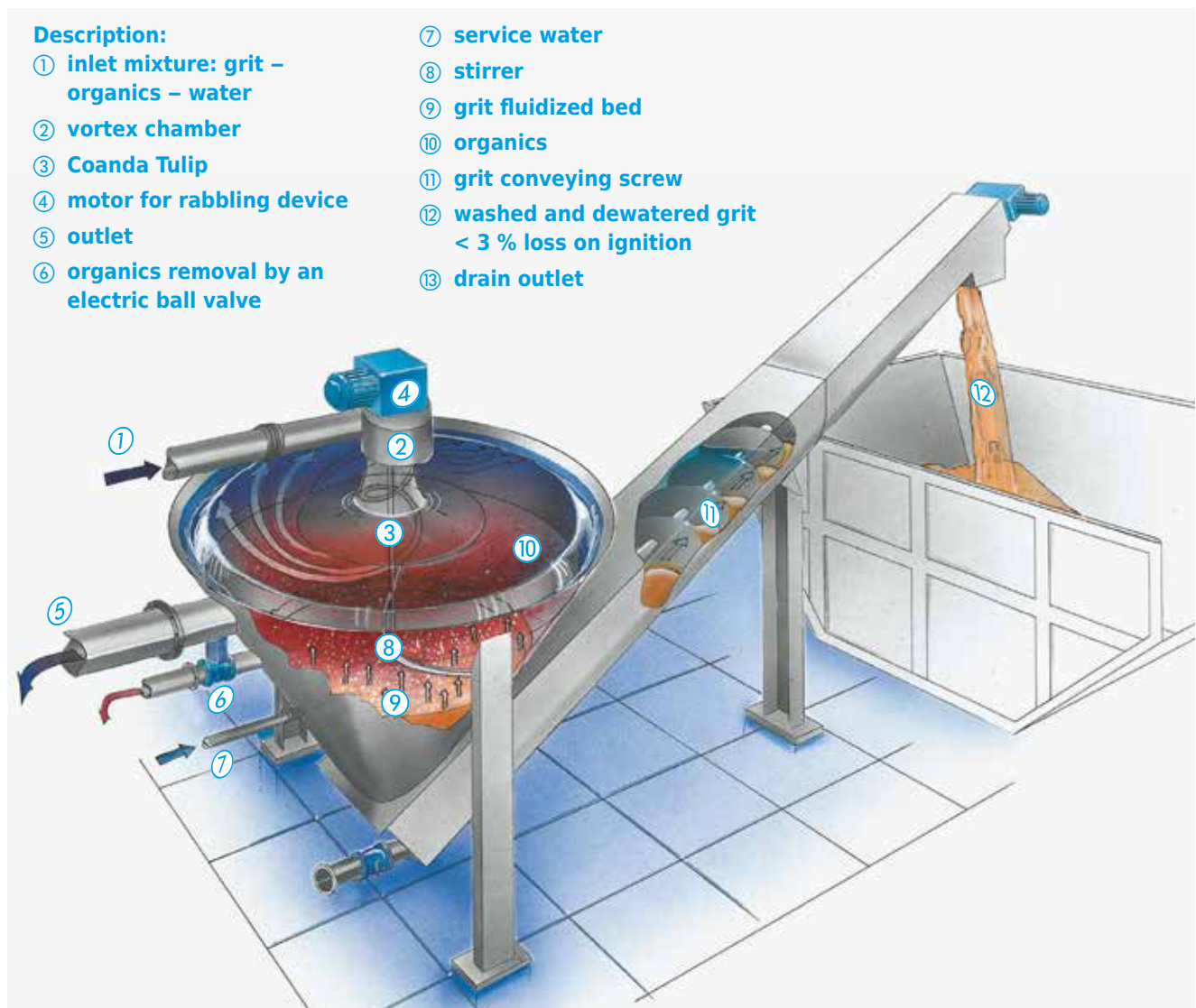
Flow diagram of a HUBER Coanda Grit Washer RoSF4.

This results in inevitably high costs for dewatering, removal, transport and disposal.