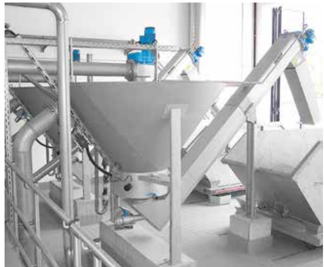
Reduced disposal costs and improved hygienic conditions with the HUBER Coanda Grit Washer RoSF4.