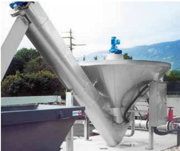
Innovative technology: HUBER Coanda Grit Washer RoSF4 size III with frost protection for outdoor installation.