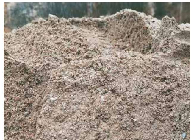
Washed grit removed at a wastewater treatment plant.