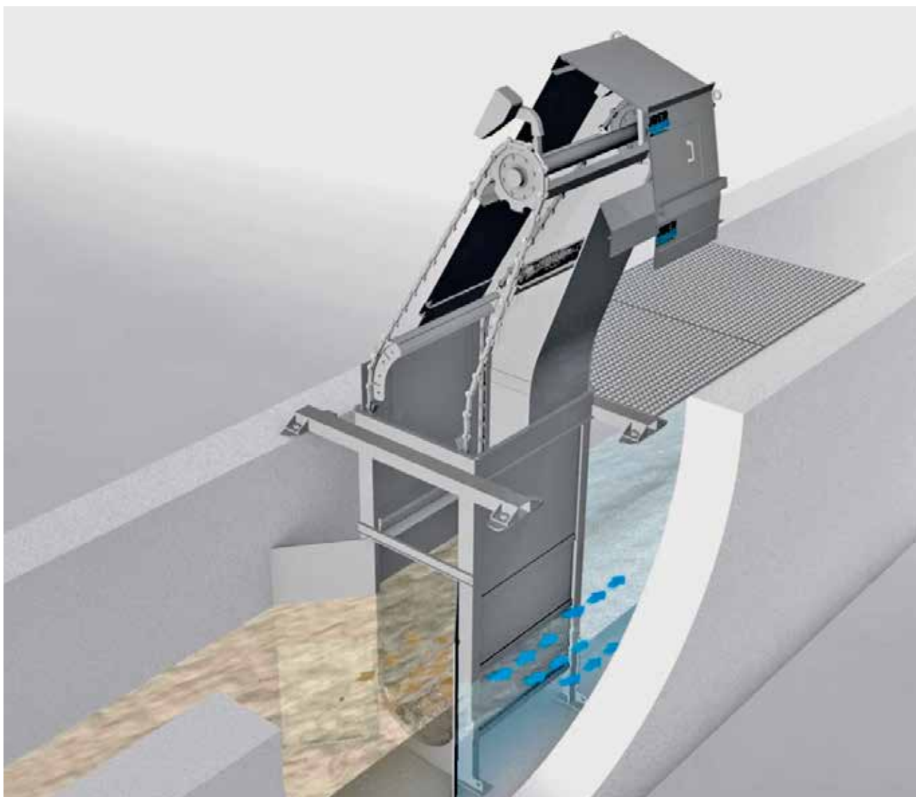
Schematic drawing of the HUBER Multi-Rake Bar Screen RakeMax® CF with its U-shaped bar rack for an increased hydraulic throughput capacity.

At the end of the bar rack cleaning cycle the rake is positively cleaned by a pivoted comb which reliably discharges the removed screenings into a downstream transport or disposal unit. The easy to access and maintain drive unit is installed above the channel.